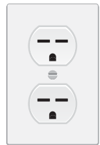
240 VOLT CIRCUIT